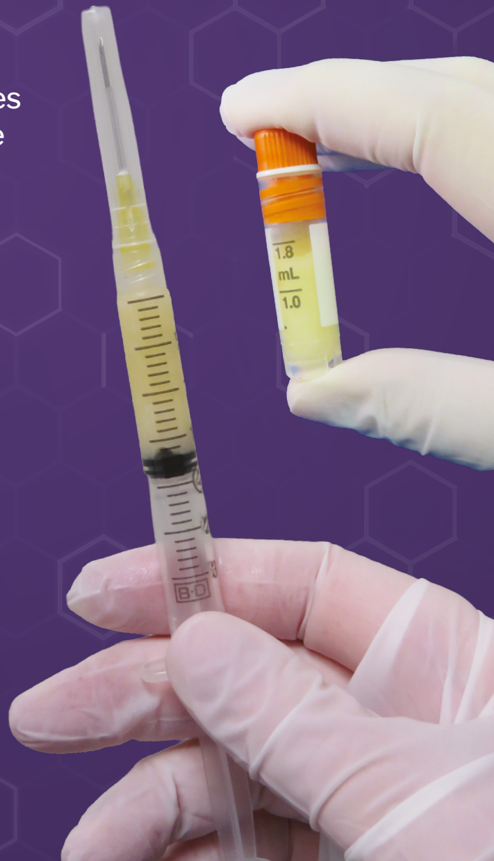
No BioCushion ®