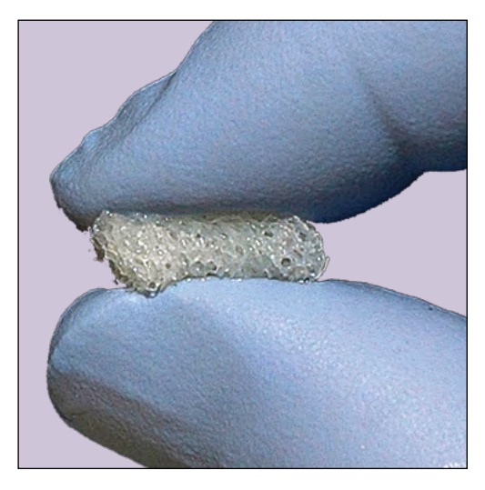
BEAST™ OsteoBiologic Sponge (BOB™)